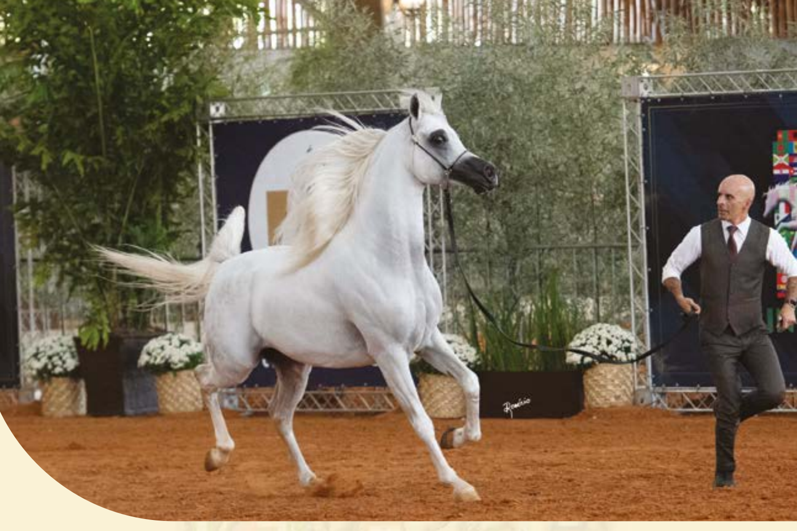
Toryno JQ (Halyr Meia Lua x Giorgia El Shawan JQ) - Gold Champion Stallion