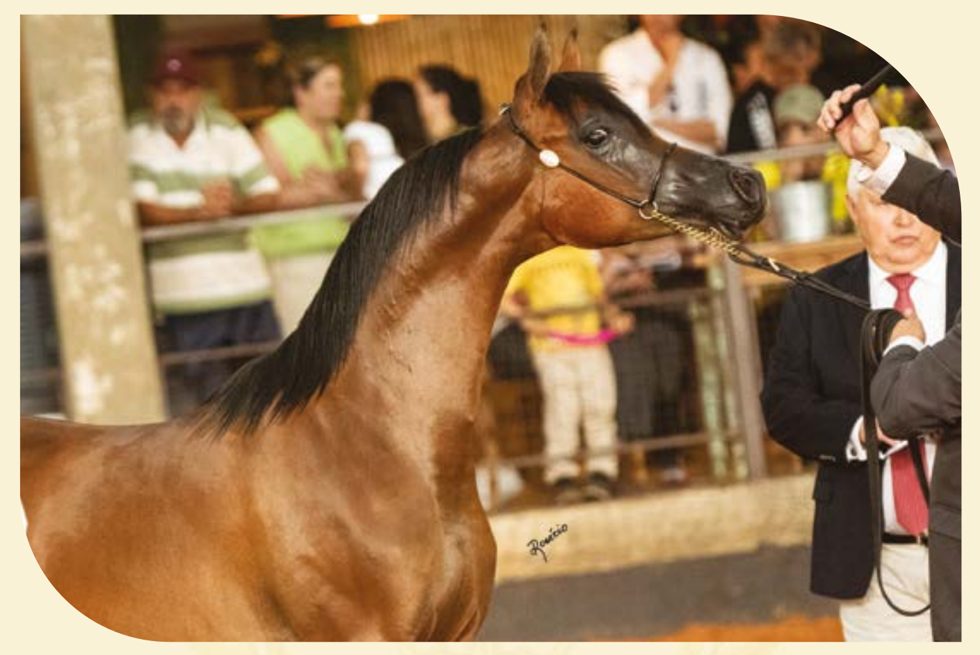
RFI Intense (Quasim CRH x Insignia Rach) - Top 2 of the Show

of the Stallion Cup. In this case we brought three of his offspring including RFI Phenomena (x Evening Star TGS by Lumiar Amadeus), RFI Raffaella (x S Rhapsody by Marwan Al Shaqab) and RFI Theodora (x Turquya Sams by HK Keav Power), as well as one grandson, RFI Fiorano (Dominic M x RFI Fahaara AlMaktub), who was sold and exported to the U.S. shortly after.