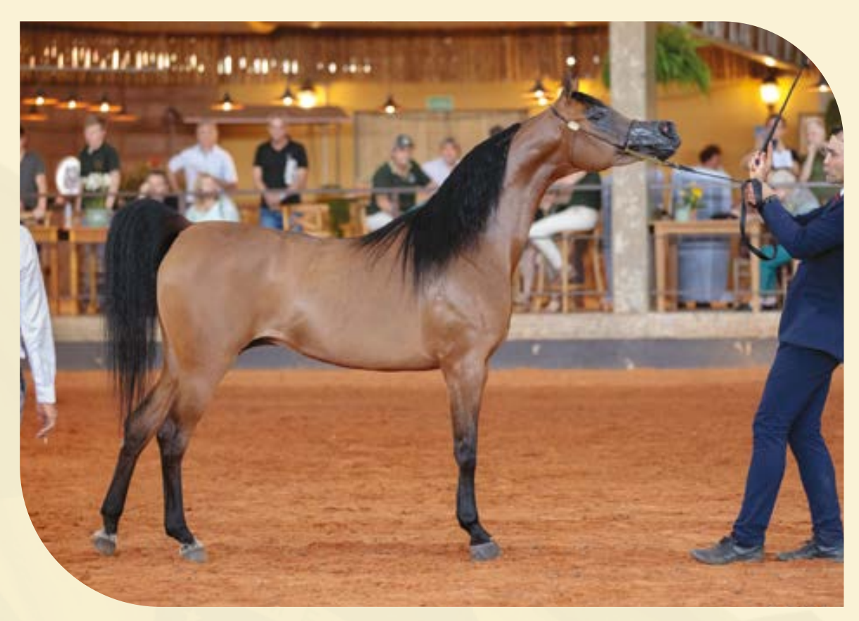
Felma LA (Mashoor Al Mohamadia x Bela LA) – Silver Champion Mare