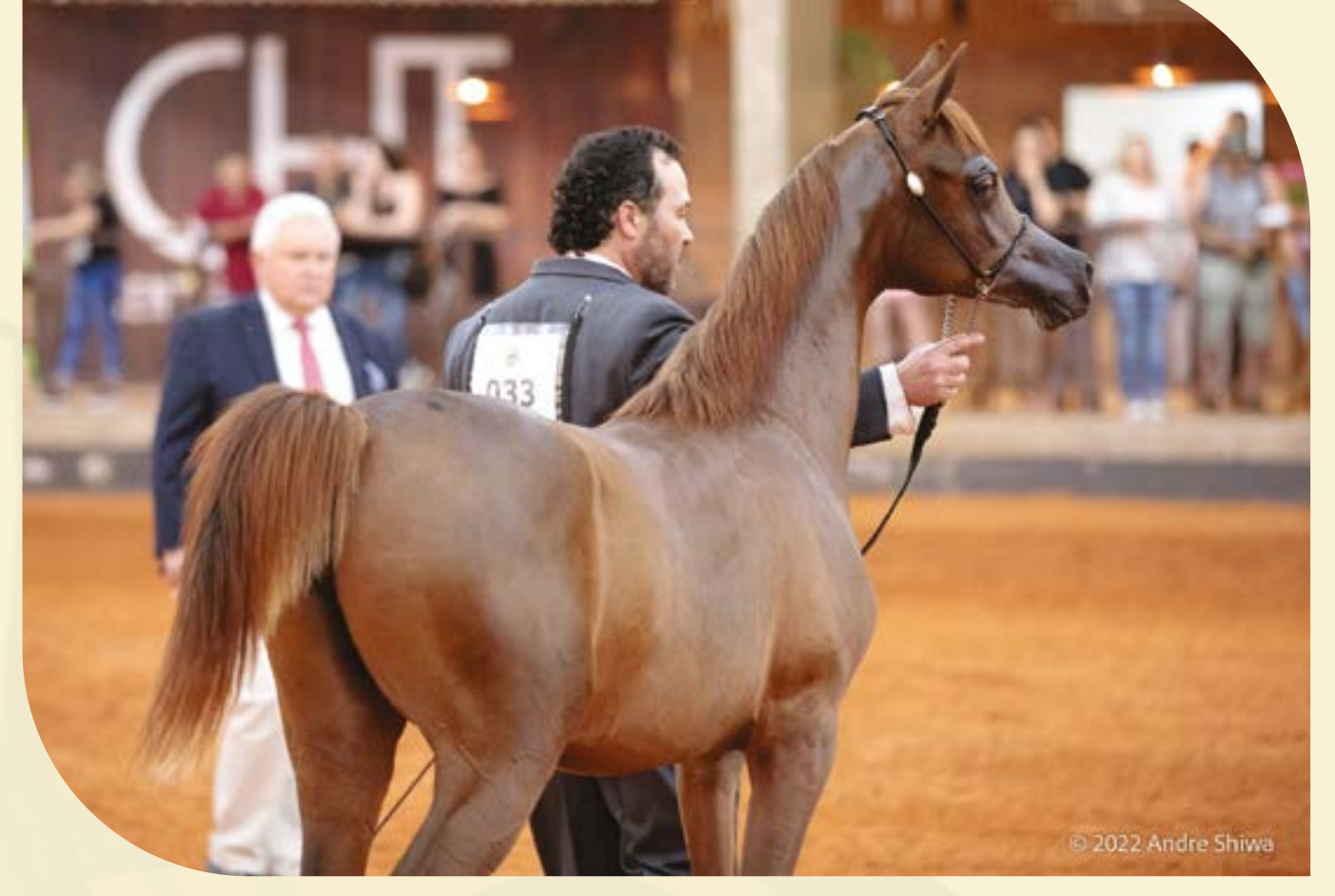
Shahbrys HVP (Royal Asad X Rebecca HVP) - Premium Cup - Highest score of the Show