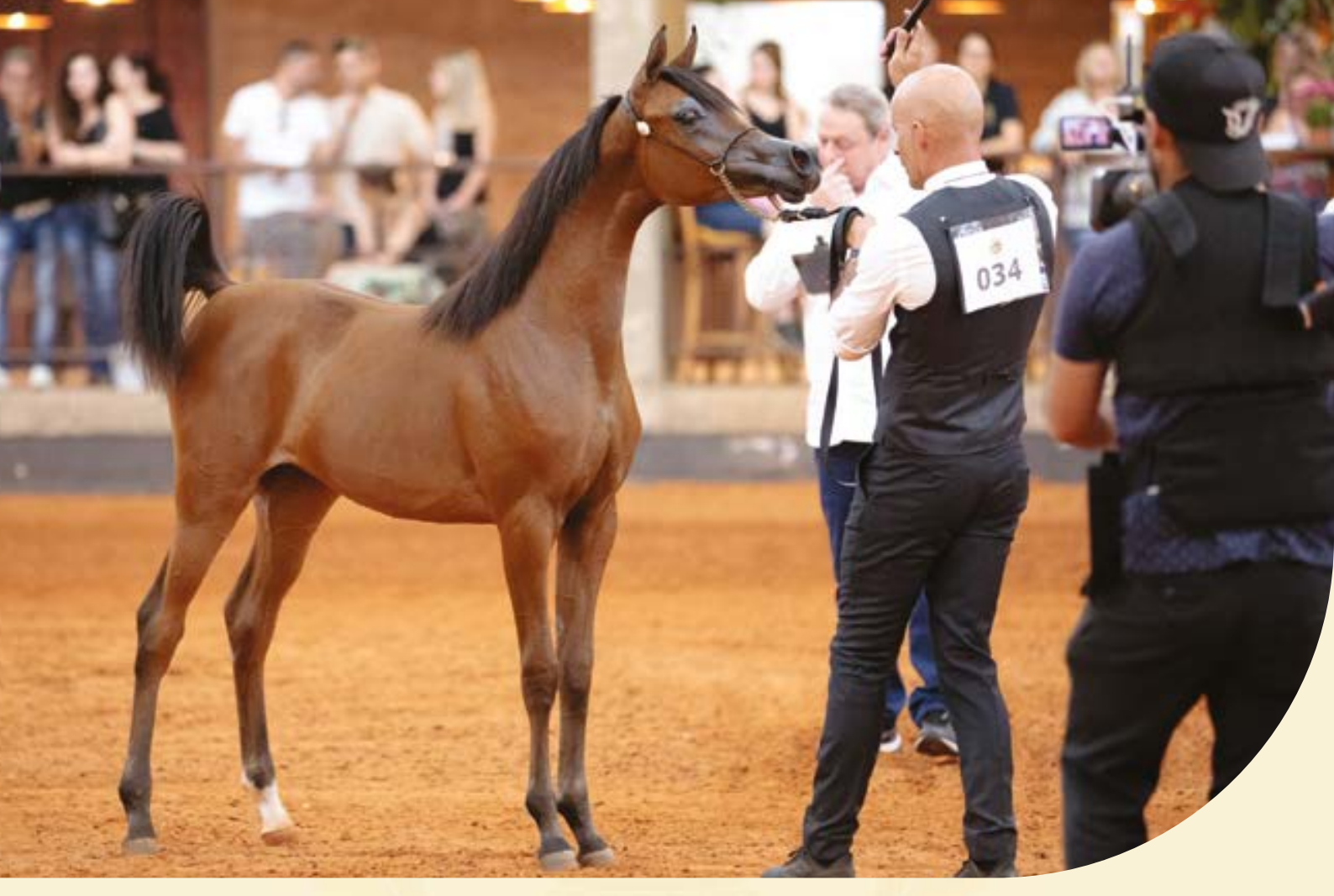
FT Marquesa (FT Saeed x FT Miss Moon) - Top 9 of the Show