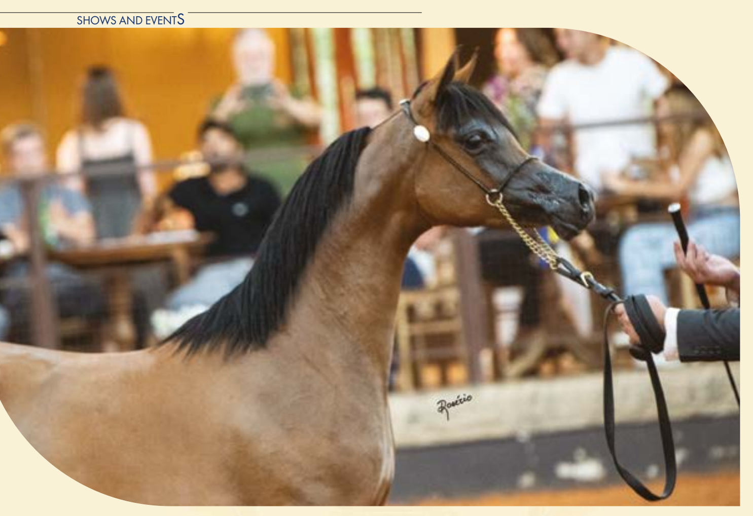
RFI Elena (RFI Unique x RFI Elisha) - Top 7 of the Show