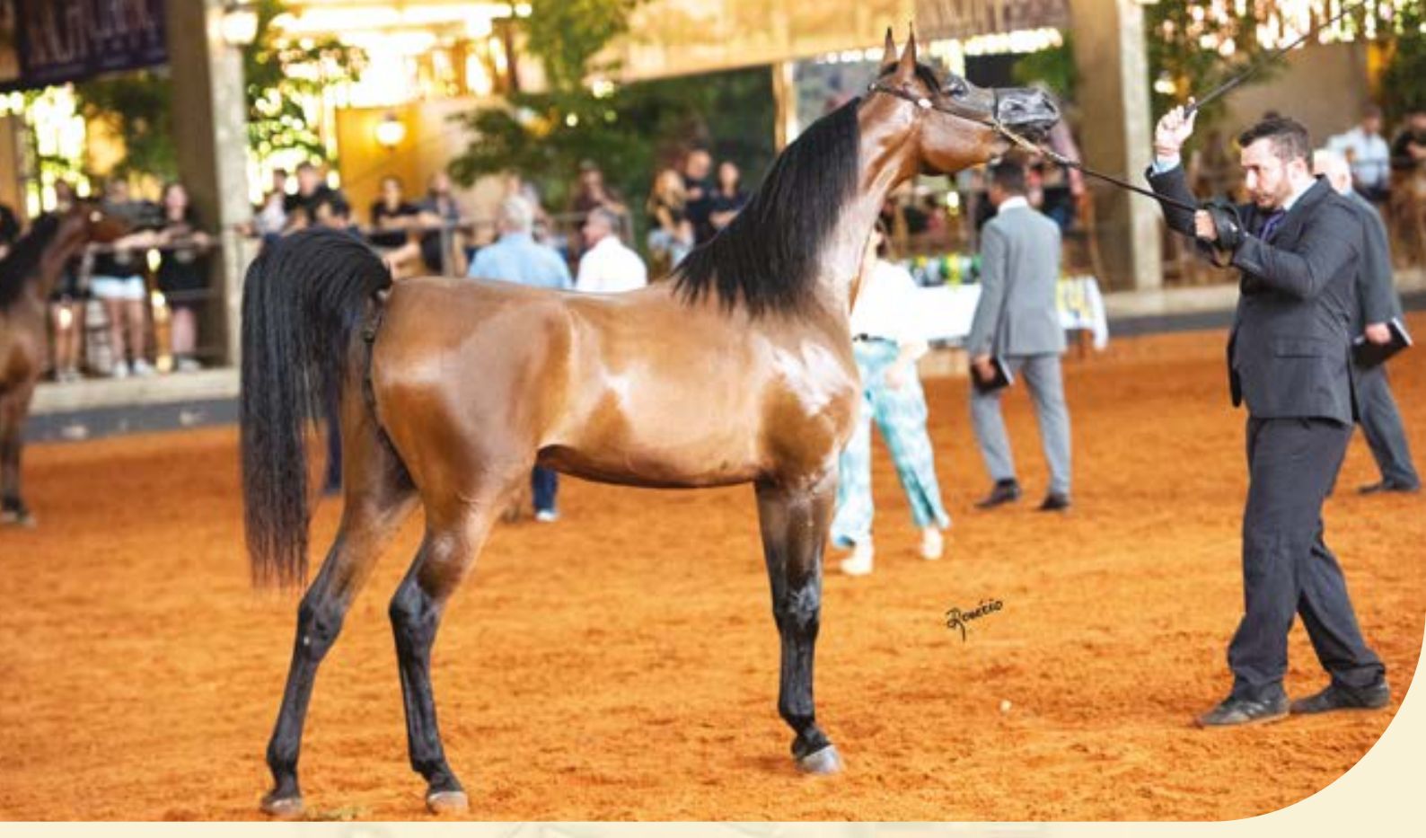
Carandá Lulikah (Bandit SRA x Sahara Latifa) – Gold Champion Filly