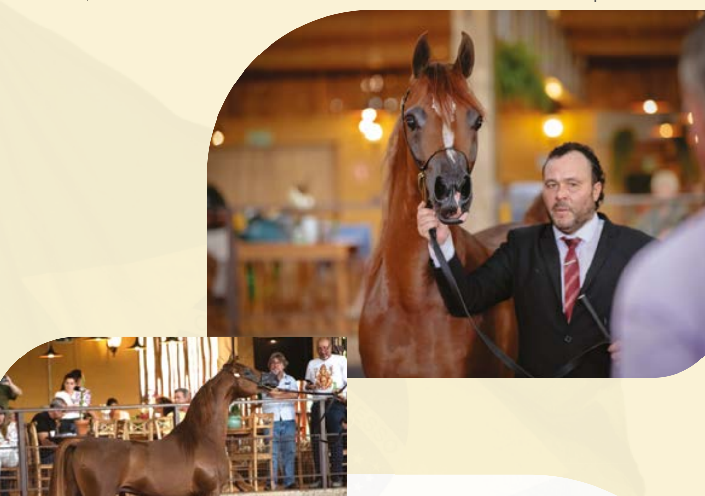
Stefan FK (Dominic M x Big Soul W) – Bronze Champion Stallion

Daimmen HVP (Nuzyr HCF x Maqna Leenda HBV) – Silver Champion Stallion