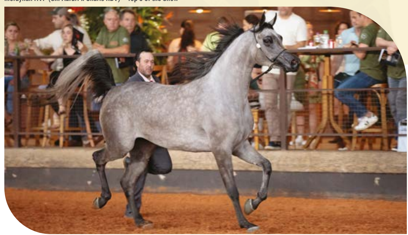
Moraynah HVP (SM Azraff x Charis RBV) - Top 8 of the Show