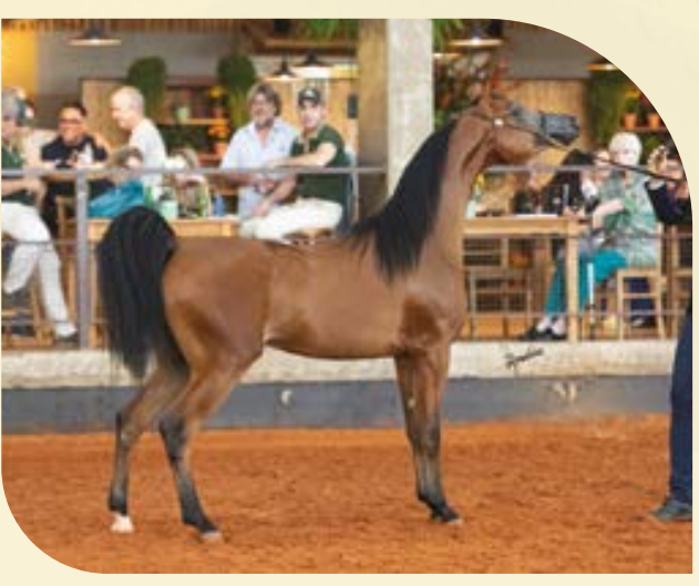
Gazani JSZ (Gazal Al Shaqab x Sahara Gallina) – Bronze Champion Jr Colt