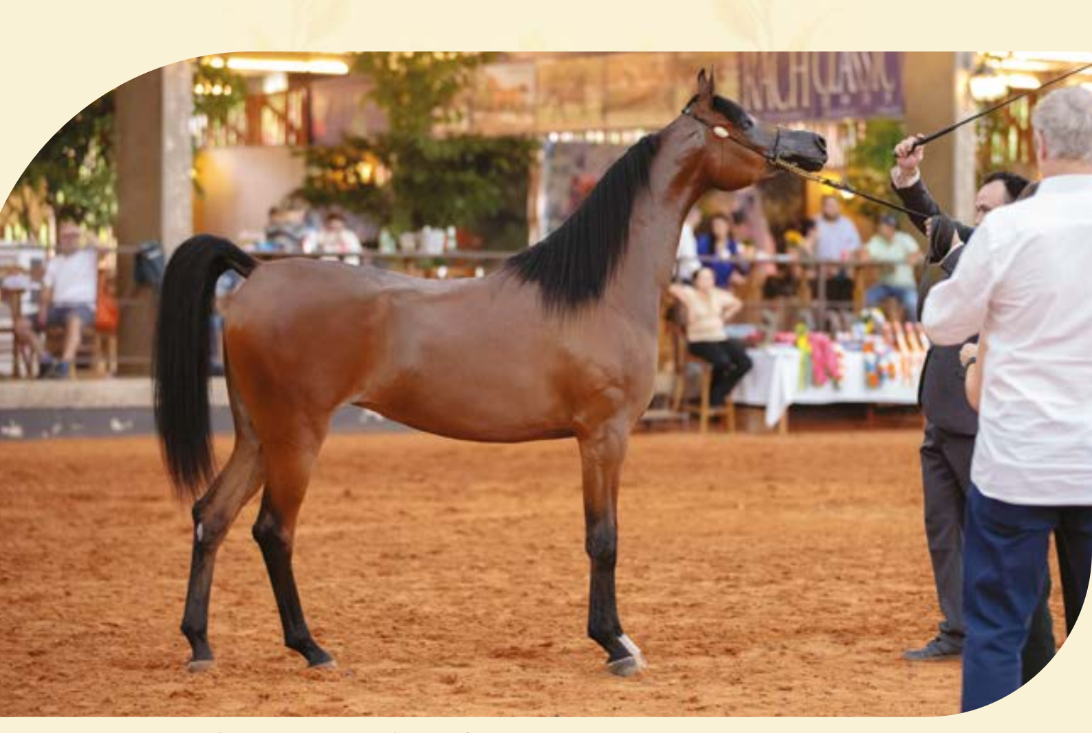
La Belle de Jour HBV (Pharaoh HBV x Prada HBV) – Top 4 of the Show

And lastly we decided to take an older filly, Jamaica LA a very feminine daughter of Bandit SRA, with a long neck and excellent structure and still very different in type from the offspring of EKS Farouk.