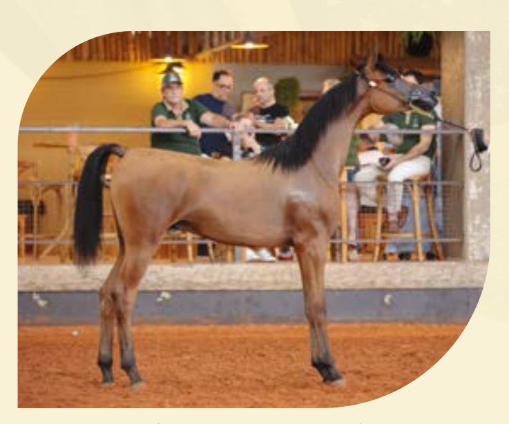
Azkaban El Farid RB (RFI Farid x Lakyshah Moon RB) – Silver Champion Jr Colt