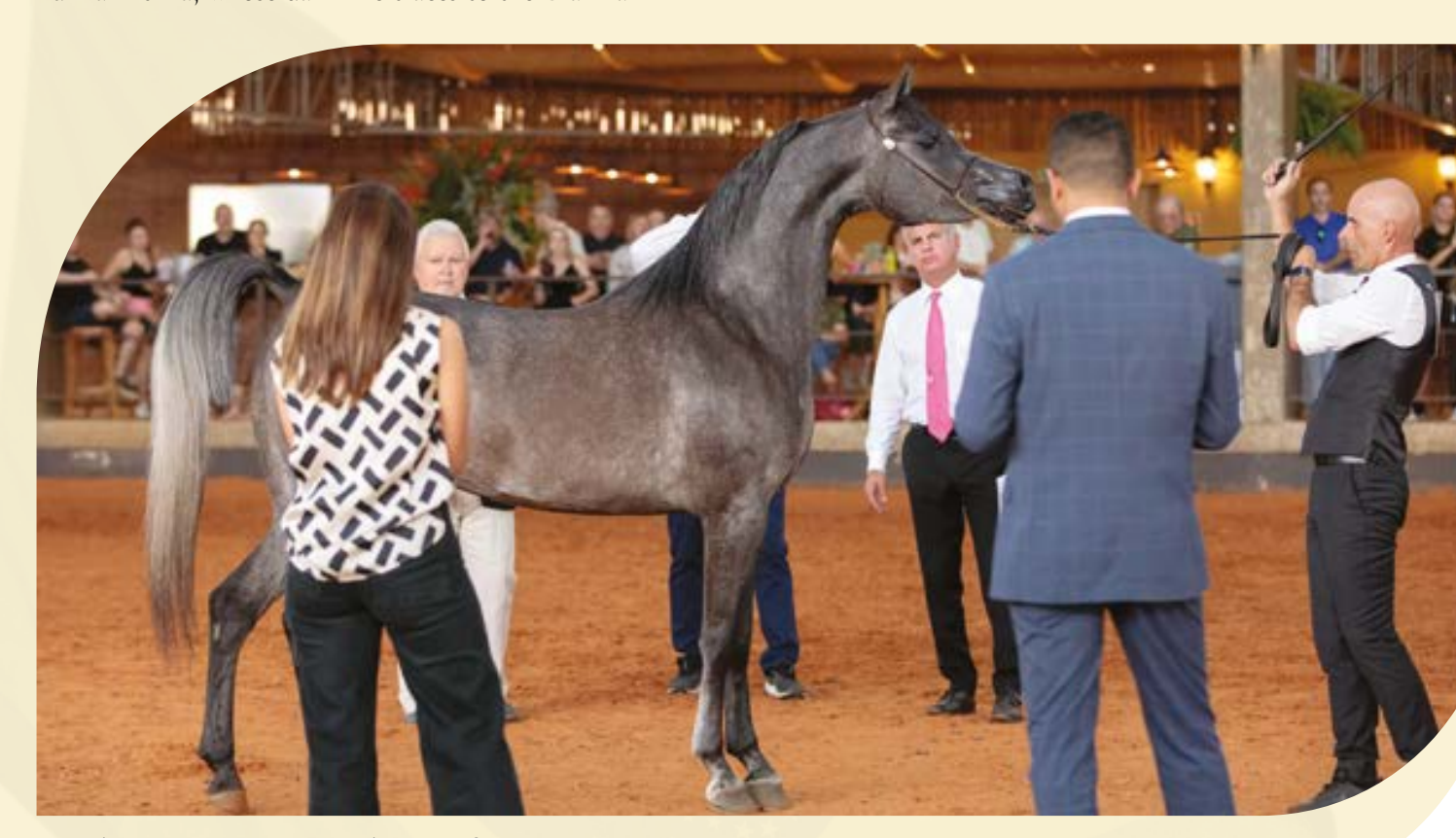
Iza 7F (Bandit SRA x Sublime Morab) - Top 3 of the Show

National Champion Promise V, as well as Varian Arabian's foundation mare Bachantka. In the mother side Shahbrys HVP is the fourth generation of HVP breeding, through Rebecca HVP who is a daughter of U.S National Champion Magnum Chall HVP whose aristocrat mother Tamaara HVP was also bred at the farm. Rebecca's dam line traces to S Justa Dream, the mare that won most U.S National halter titles in history. Guess the apple really did not fall far from the tree in this case!