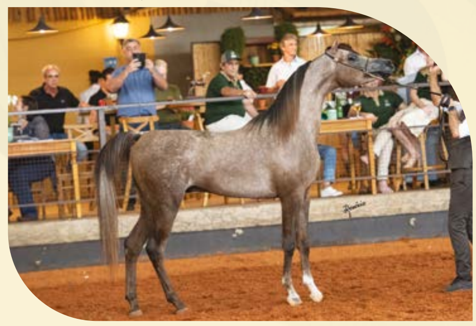
Kamal Ali HEC (HP Ali x Khyki HEC) - Silver Champion Colt