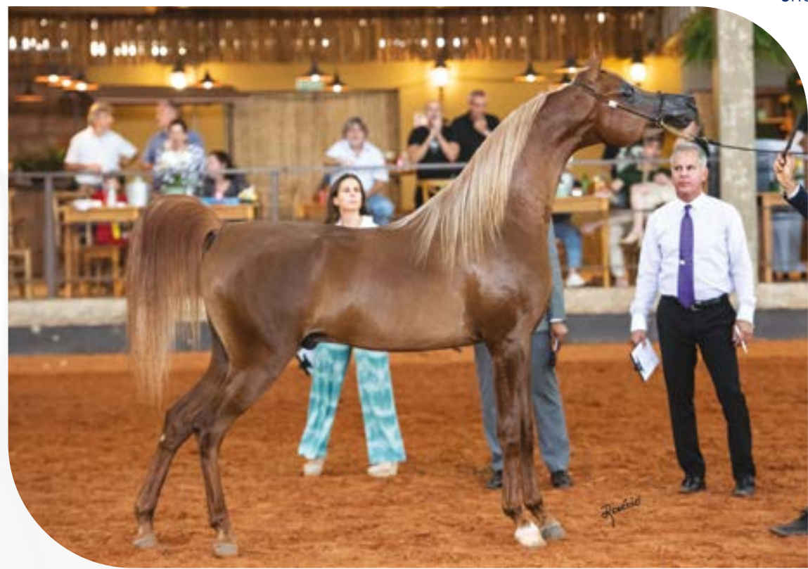
HK Gran Valehoso (Dominic M x HK Sweet Müsique) – Gold Champion Colt