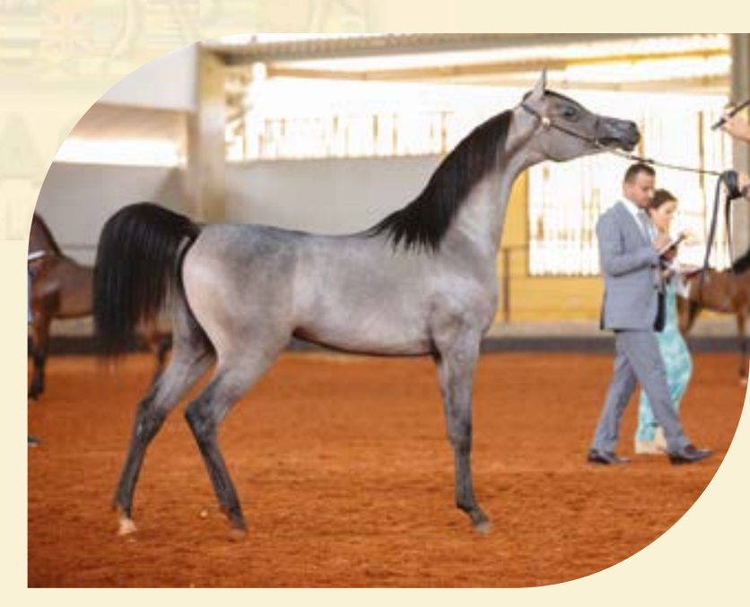
FT Simphonia (FT Saeed x FT Sephora) – Silver Champion Jr Filly

as the famous FT Shaella. The winner of the Bronze was Katara LA, a daughter of EKS Farouk and the WH Justice daughter Dakota LA, bred and owned by Haras Cruzeiro.